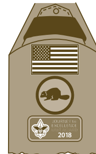
WITH DEN EMBLEM