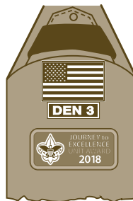
WITH DEN NUMERAL